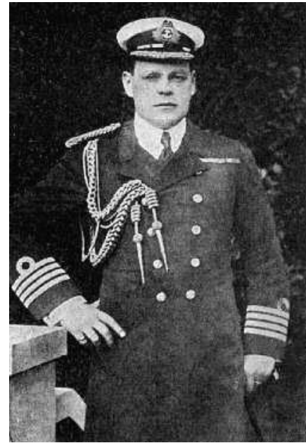
ADMIRAL SIR ROSSLYN WEMYSS