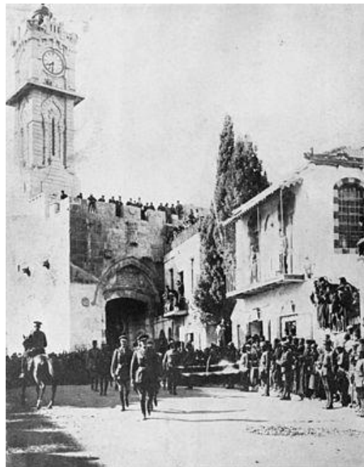
GENERAL ALLENBY ON FOOT ENTERS JERUSALEM 11 DEC 1917