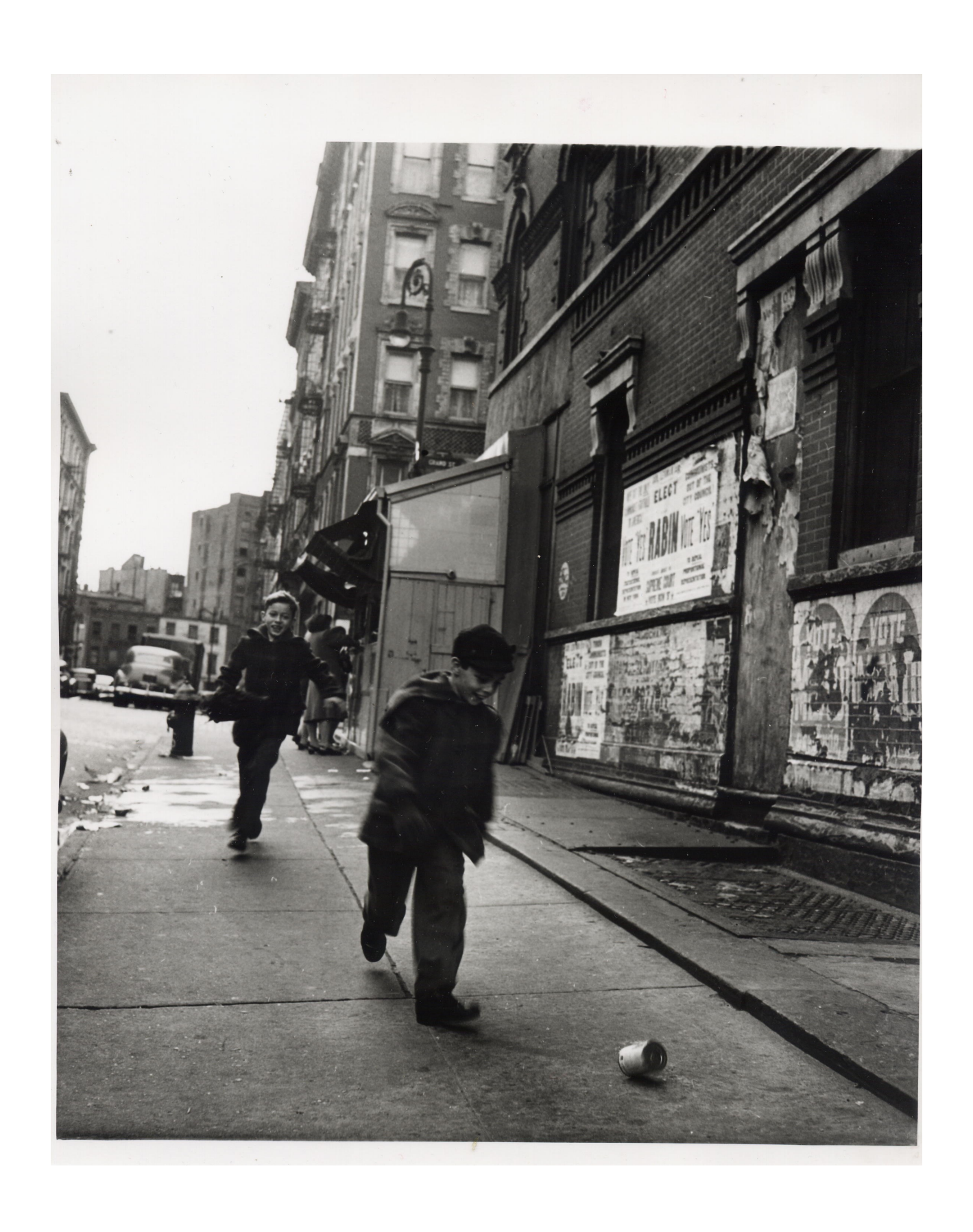
Children playing a game called 'Kick Can'