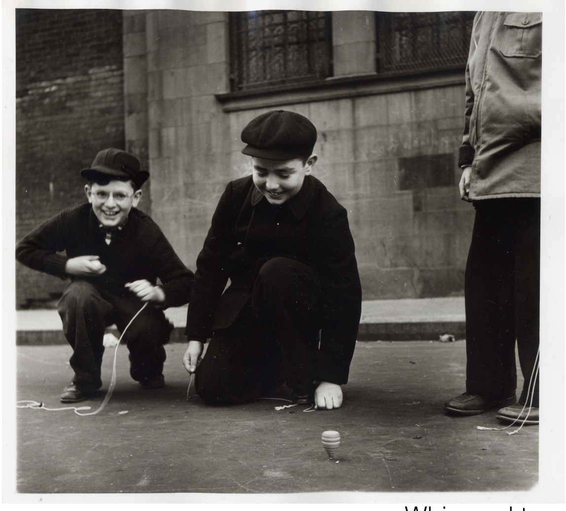
Whip and top