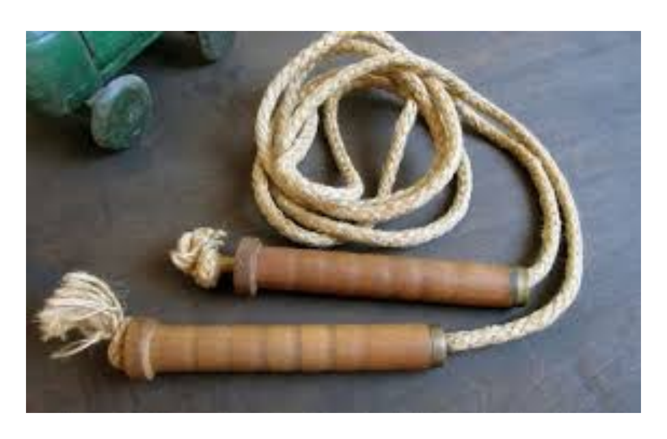
A skipping rope