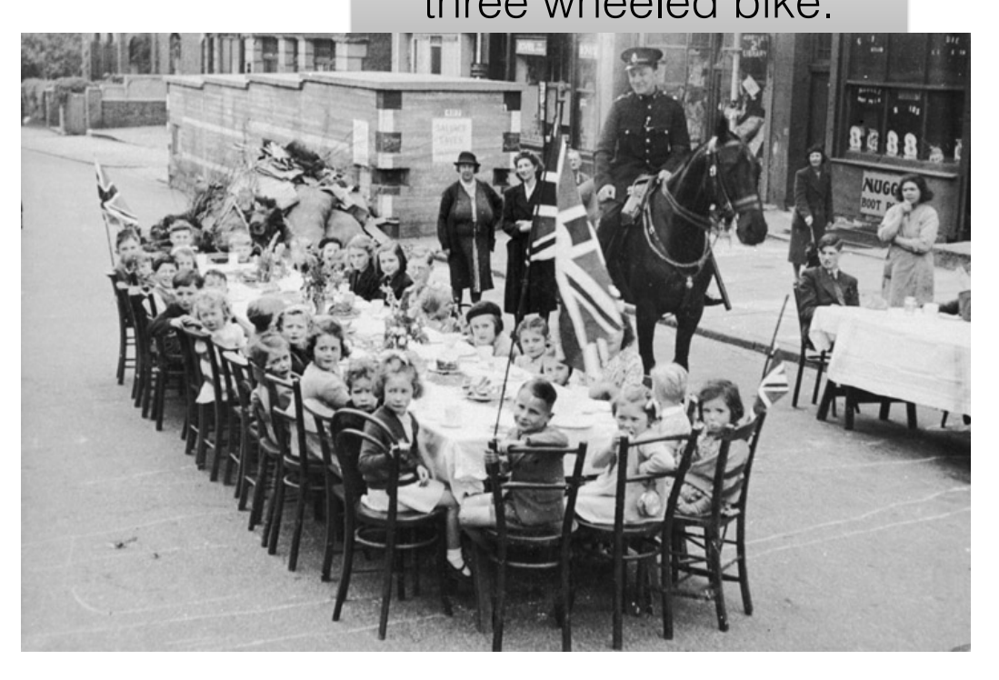
1945 Children's street party to celebrate the end of the war.