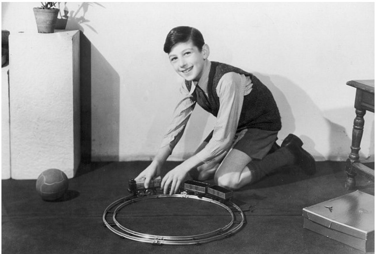
Typical boy's presents on a christmas morning if they were very lucky.