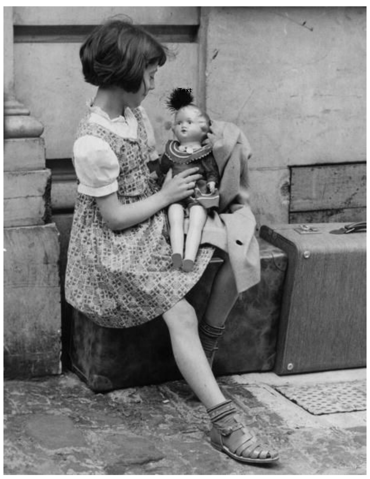
Little girl with her dolly. This would have been made of 'Pot'.