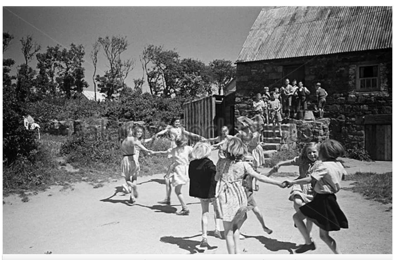
Ring a Ring of Roses a Pocket full of Posies